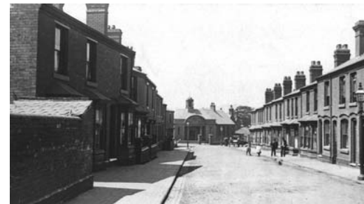
The new library from Barrs Street in 1912