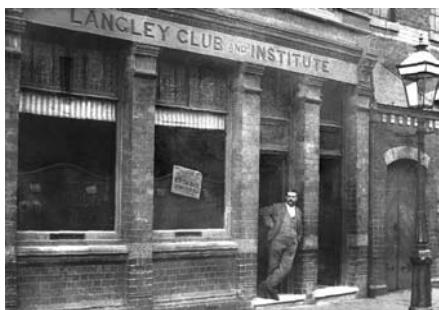
Langley Institute, High Street, Langley, late 19th century, home to first library

Many of these men and women sought to 'improve' themselves, and this was encouraged by leading citizens and industrialists, such as the Albright, Chance and Wilson families. In the 1870s, the temperance movement established a coffee house to combat the widespread drunkenness, and this soon developed into the 'Langley Club and Institute'.