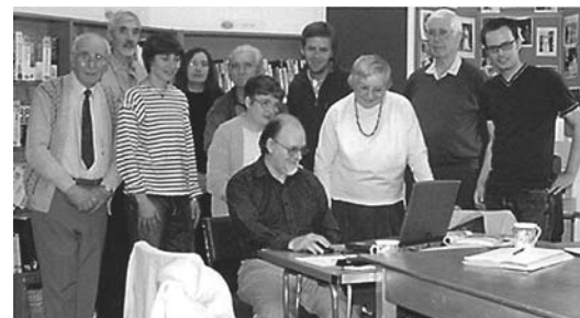
'Silver surfers' in 2001 designing a web-site for the Poetry Appreciation Society

and it has to meet elsewhere, even if in its heart it remains part of the library, and its management committee still continues to meet there.