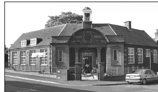
A hundred years on!